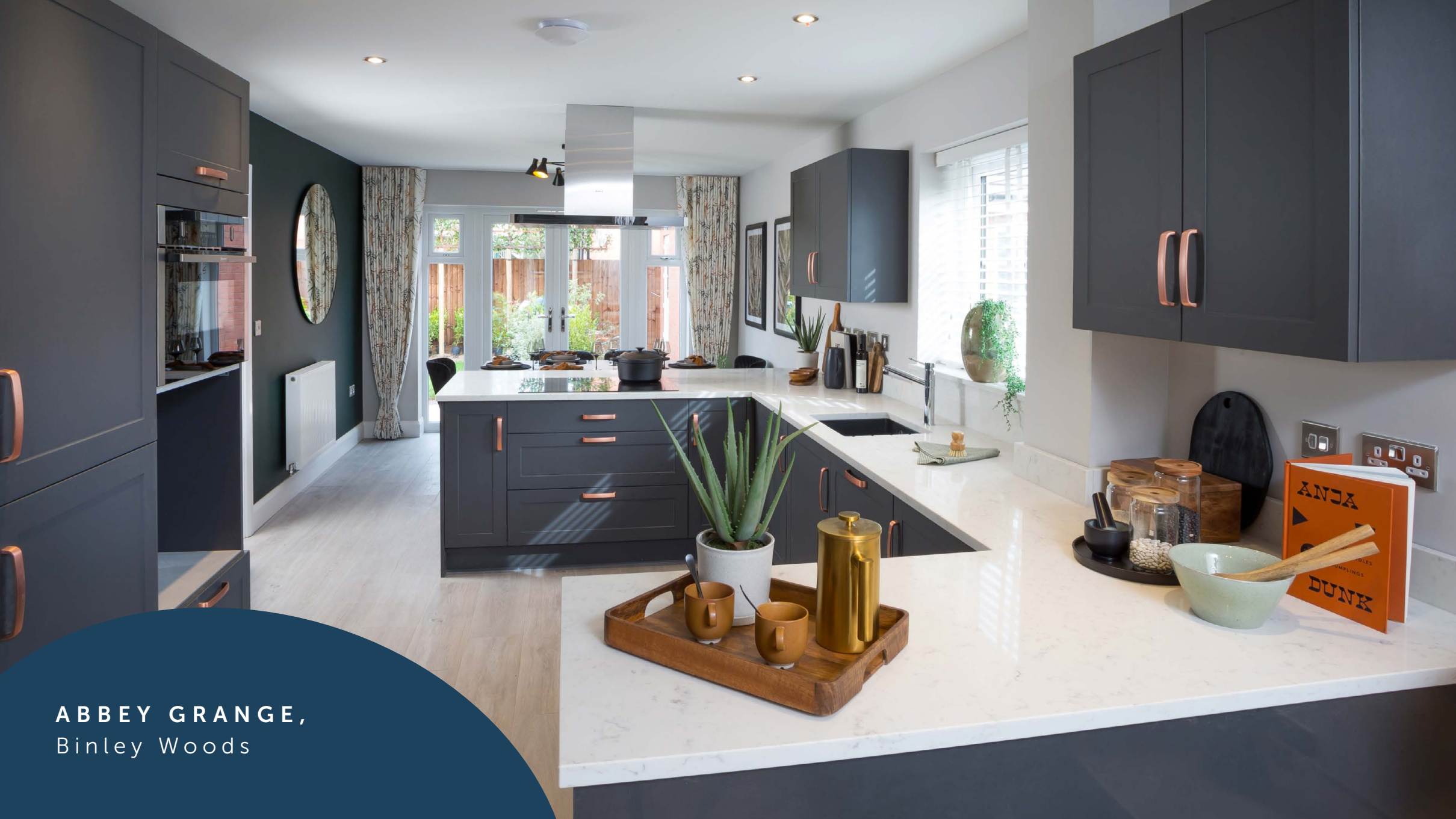
ABBEY GRANGE, Binley Woods