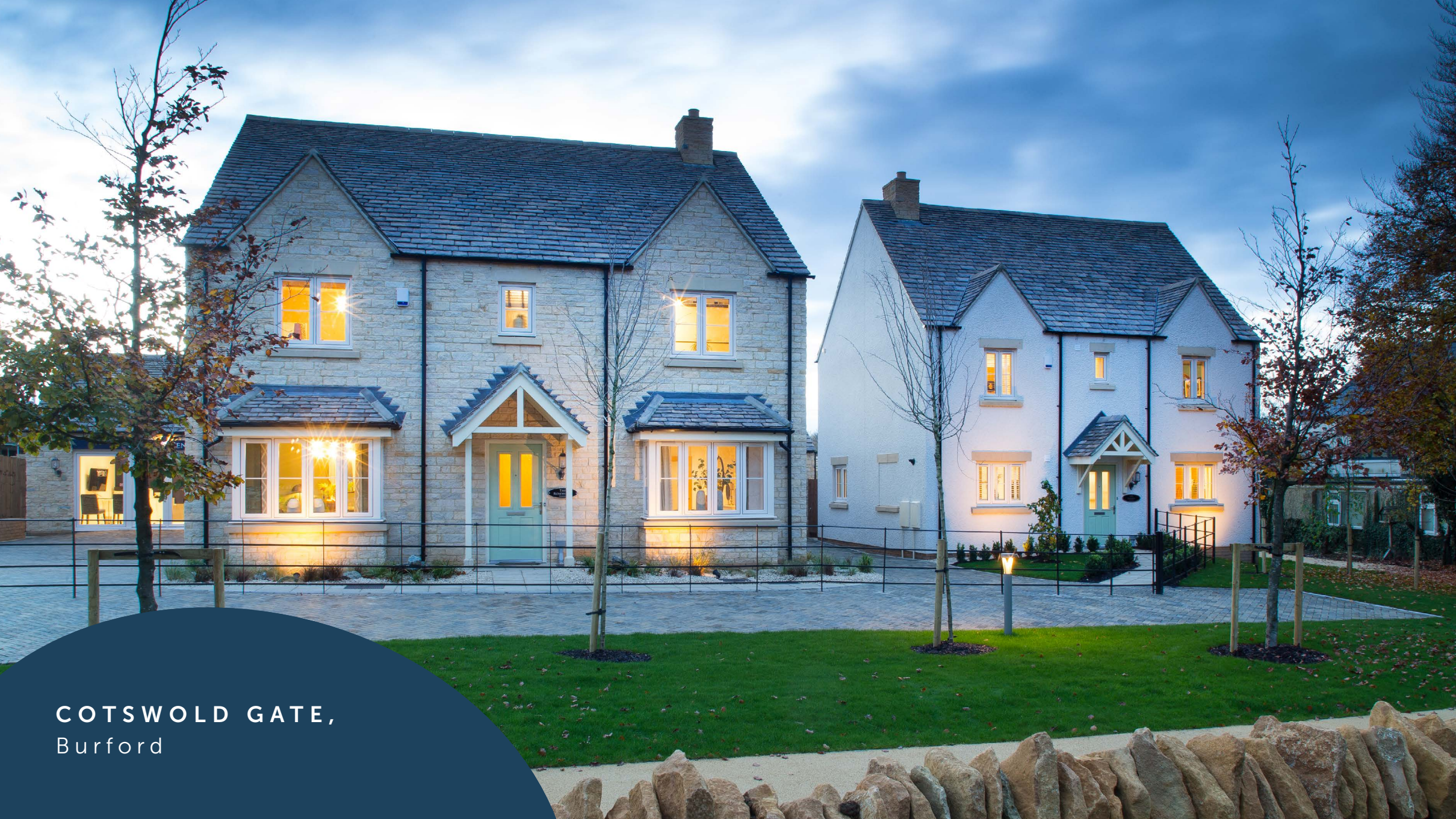
COTSWOLD GATE, Burford