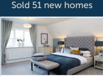
Sold 51 new homes