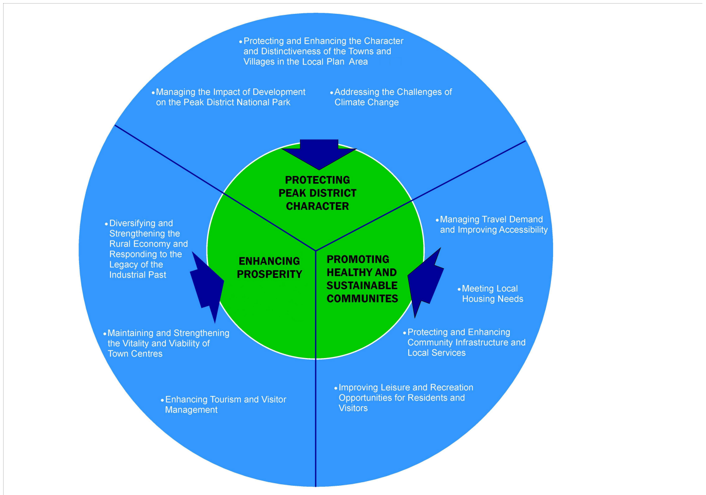
Diagram illustrating the relationship between the themes and key issues in the 2016 Local Plan