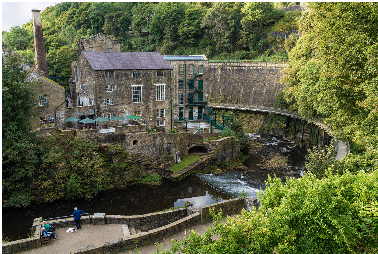
The Torrises, New Mills

Details of how we will use your data are provided in our Privacy Notice which is available to view at Council offices and online - www.highpeak.gov.uk/article/3875/Planning-and-Planning-Policy-privacy-notice