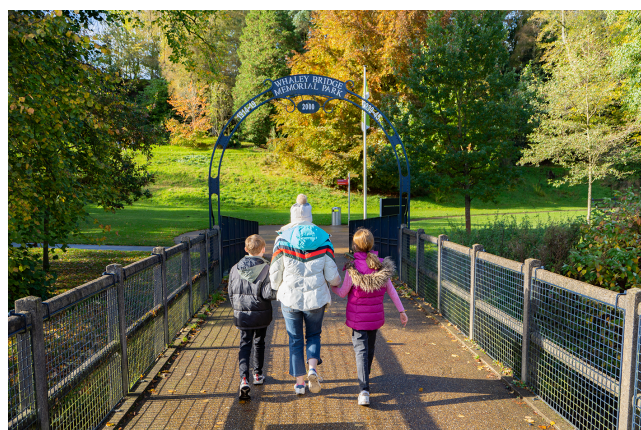
Memorial Park, Whaley Bridge