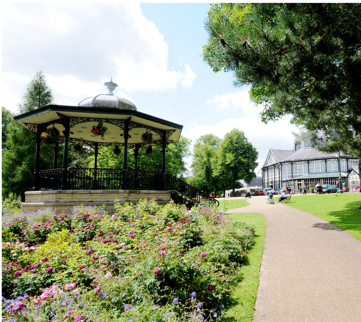
The Pavilion Gardens, Buxton

For further information on the Council's assessment of the Local Plan, please see the Local Plan webpage - https://www.highpeak.gov.uk/article/646/The-Adopted-Local-Plan-2016