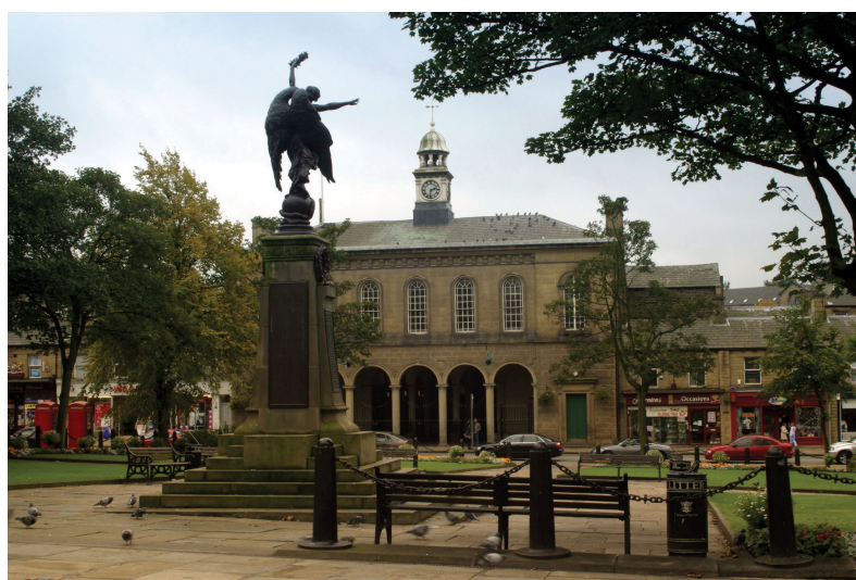
Norfolk Square, Glossop

To see more about the monitoring of the current Local Plan, please see our Annual Monitoring Reports, Five Year Housing Land Supply Statements and Infrastructure Funding Statements on our monitoring webpage - https://www.highpeak.gov.uk/article/847/Monitoring