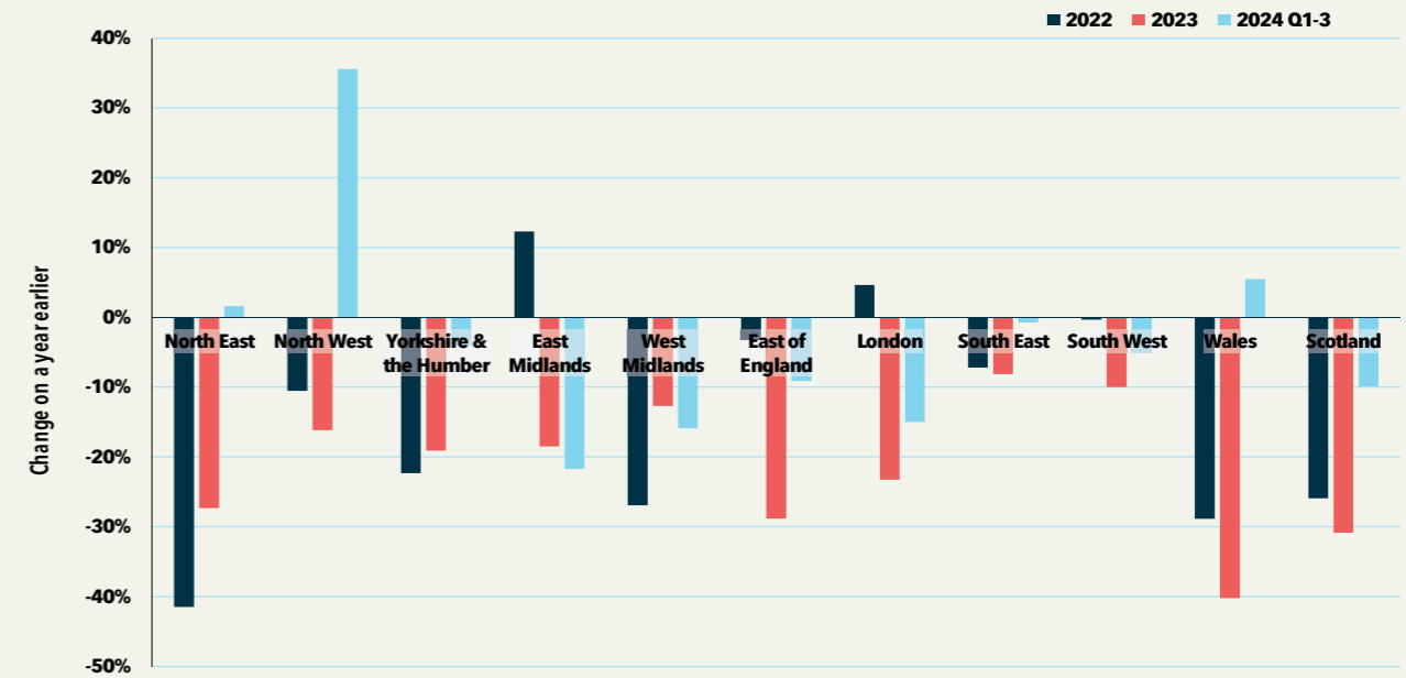
Chart 2: Residential planning approvals by region (No. of units)

N.B. Includes residential projects of all sizes, residential units on non-residential schemes and conversions.